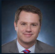
Chair: Doug McMillon President & CEO, Walmart Inc.