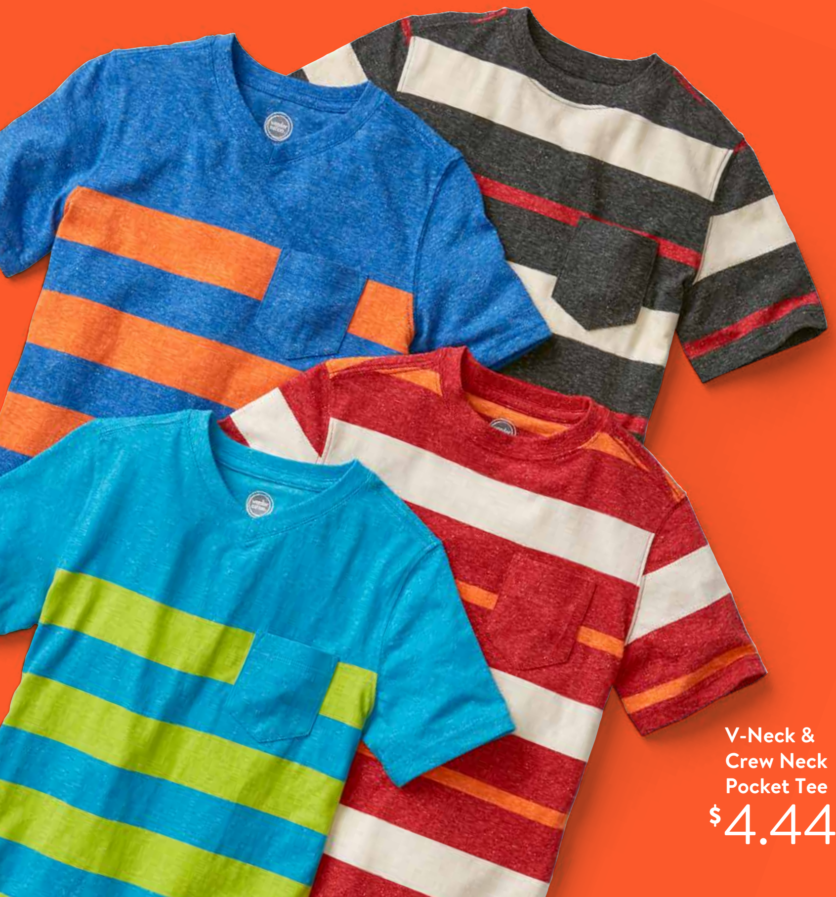
V-Neck & Crew Neck Pocket Tee $4.44