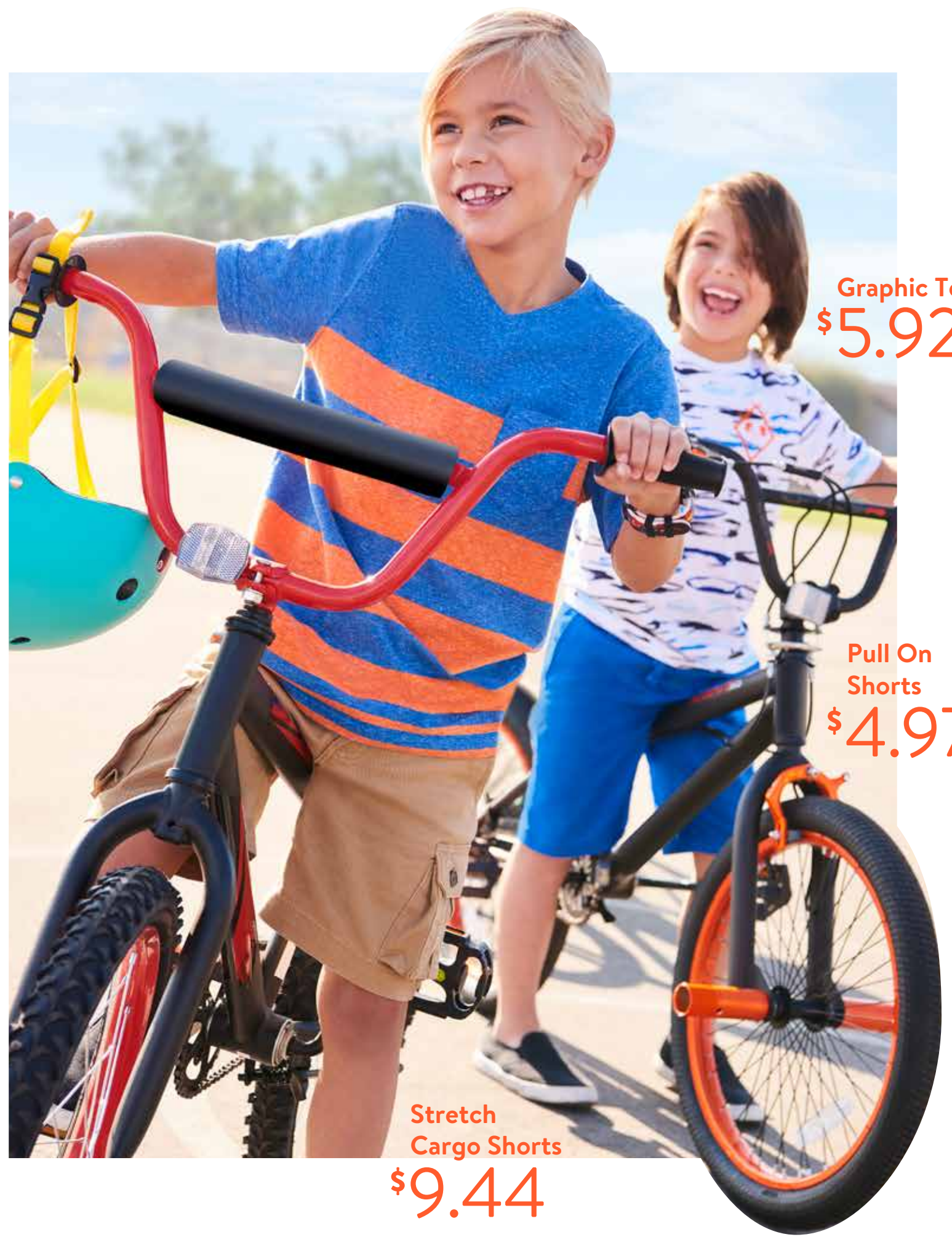
Graphic Tee $5.92