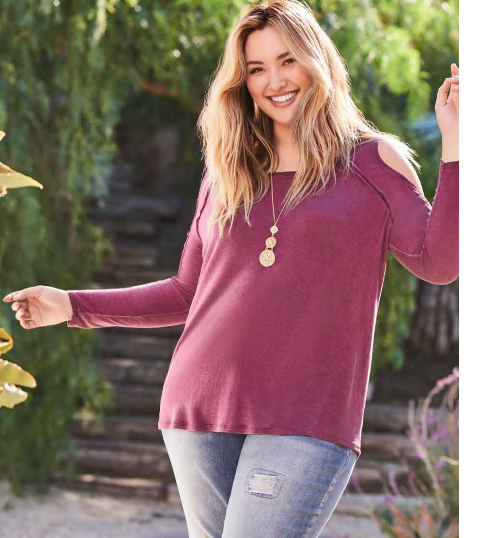
Plus Cold Shoulder Top in Purple Oxford