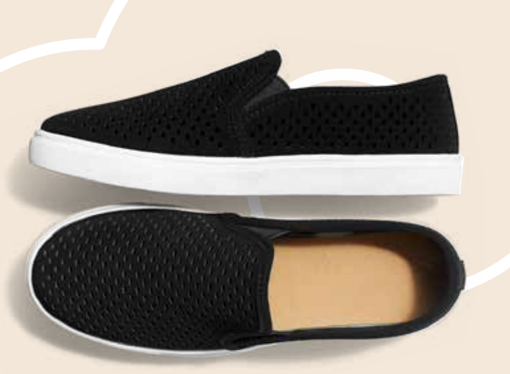
Time and Tru $12.88