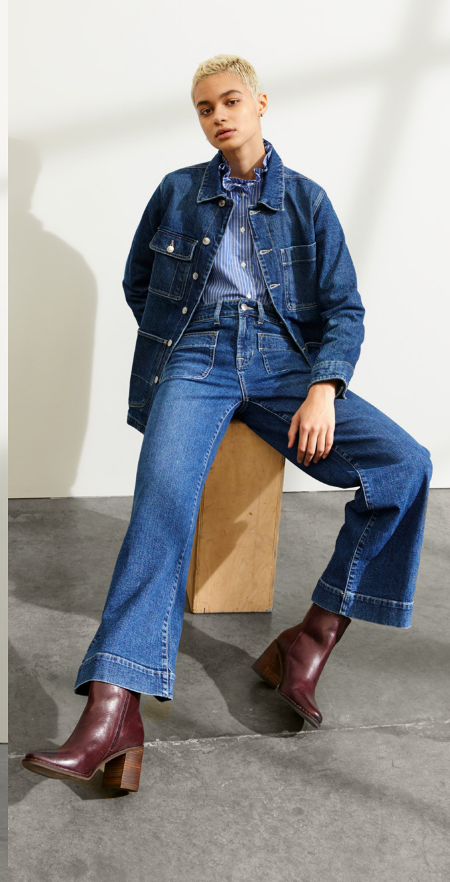
OVERSIZED DENIM BARN JACKET $36 FEMME RUFFLED BLOUSE $22 RETRO FLARE JEANS $29