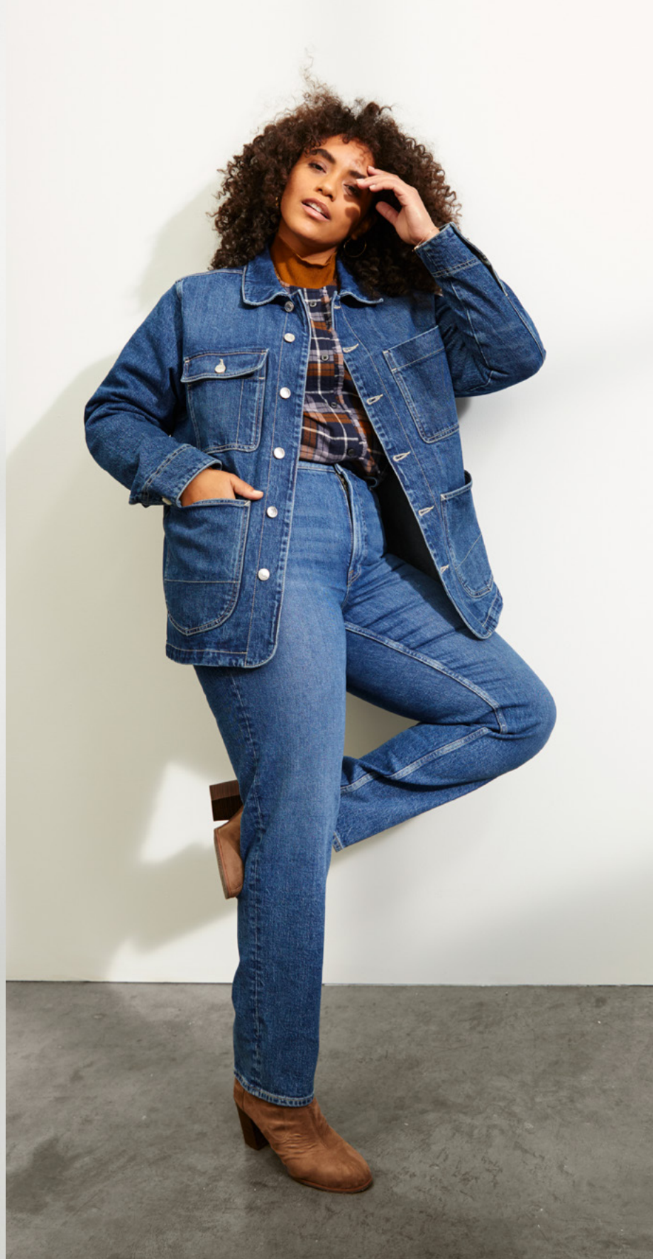
OVERSIZED DENIM BARN JACKET $36 MICRO RUFFLED TOP $22 ORIGINAL 90'S STRAIGHT LEG JEANS $27