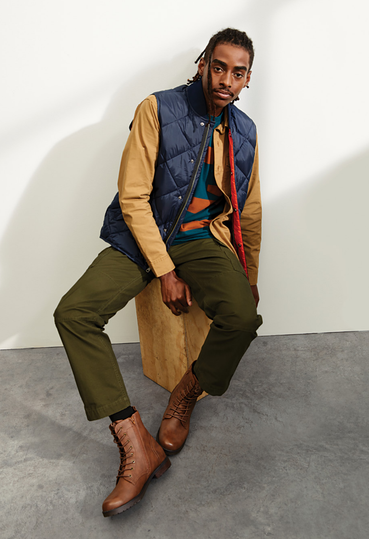
EVERYDAY DIAMOND QUILTED VEST $30 UTILITY SHIRT $25 EVERYDAY RUGBY T-SHIRT $19 CARGO PANTS $25