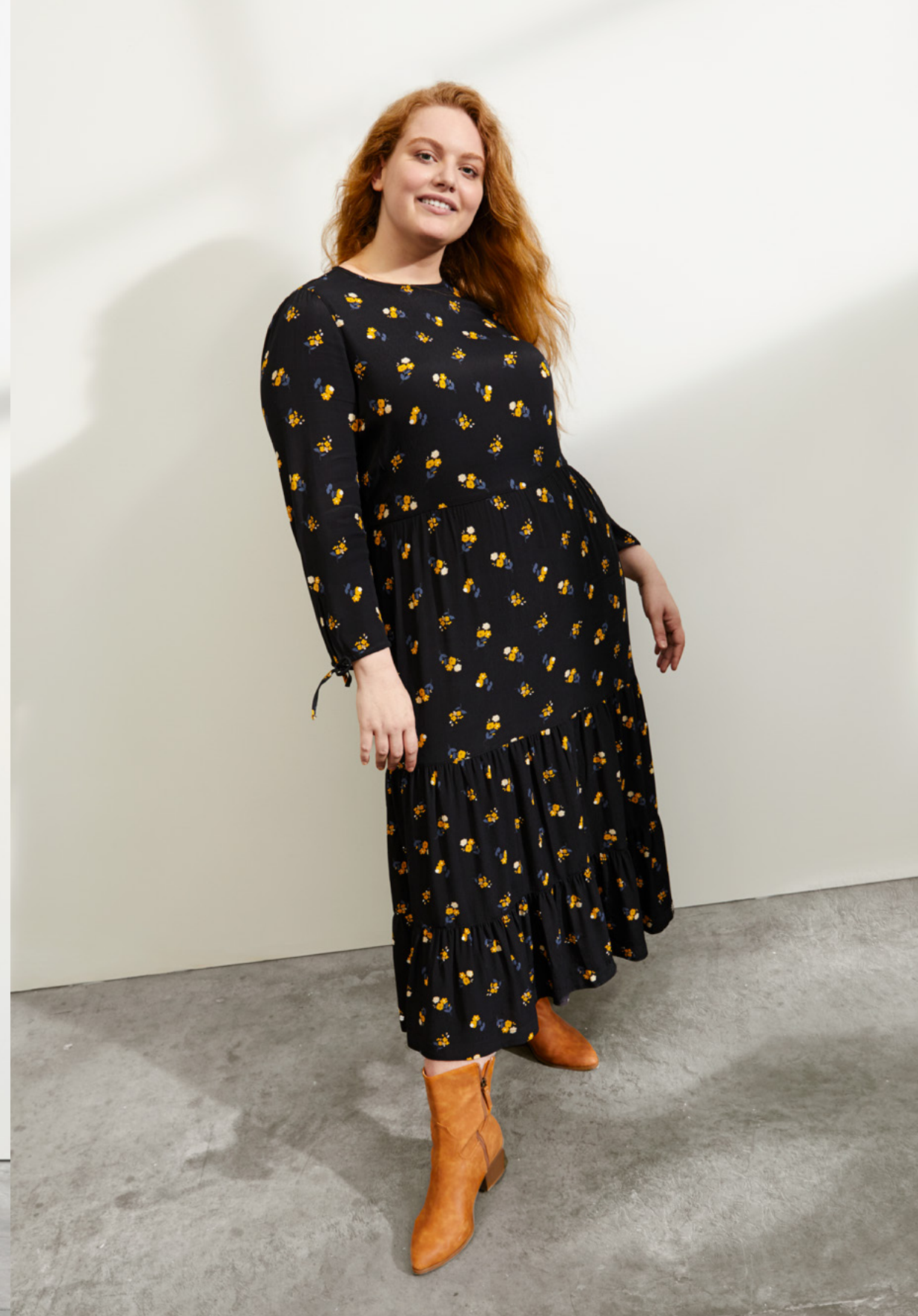
TIERED MAXI DRESS $39