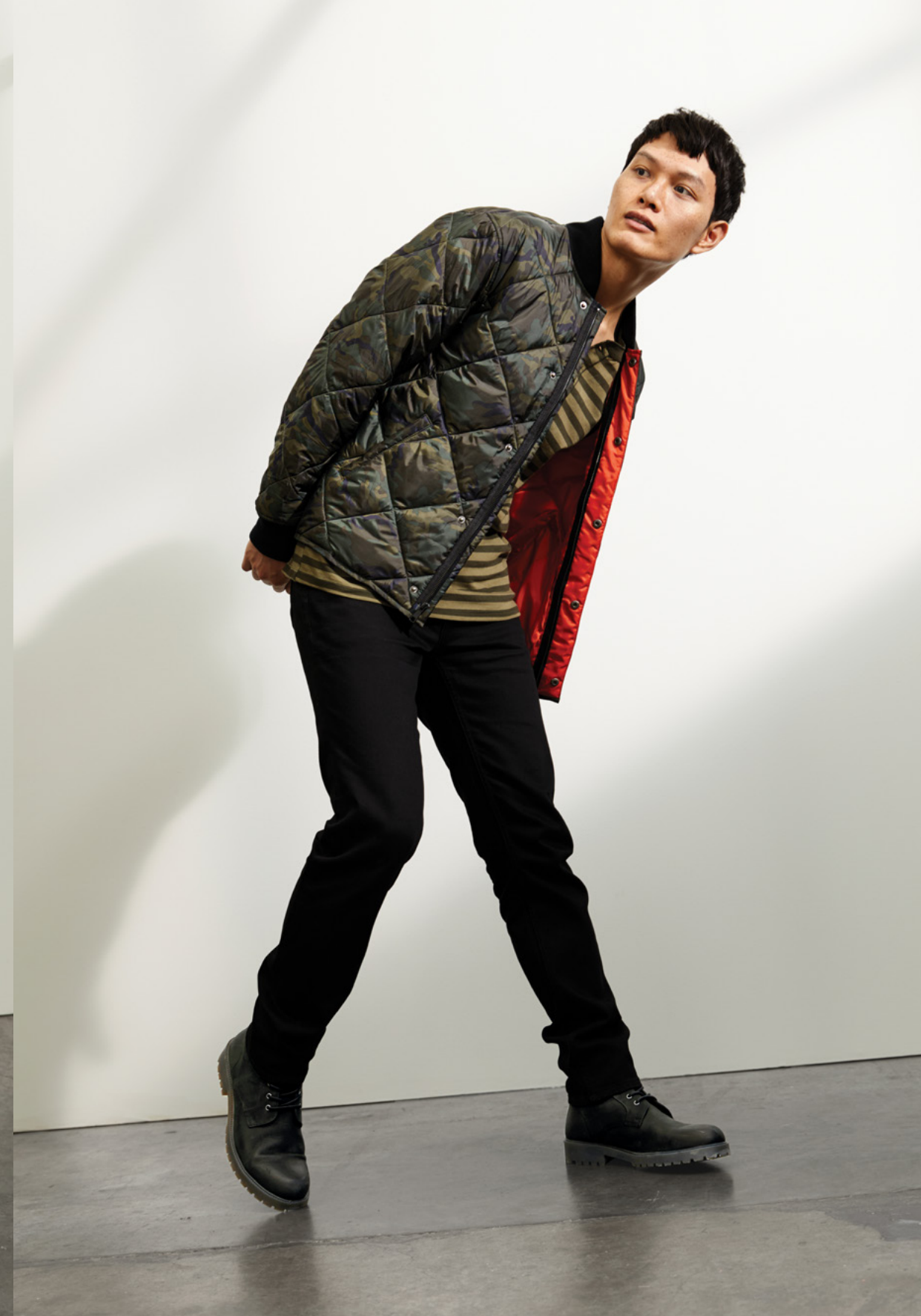
CAMO BOMBER JACKET $45 EVERYDAY STRIPED LONG-SLEEVE HENLEY $20 SLIM JEANS $27