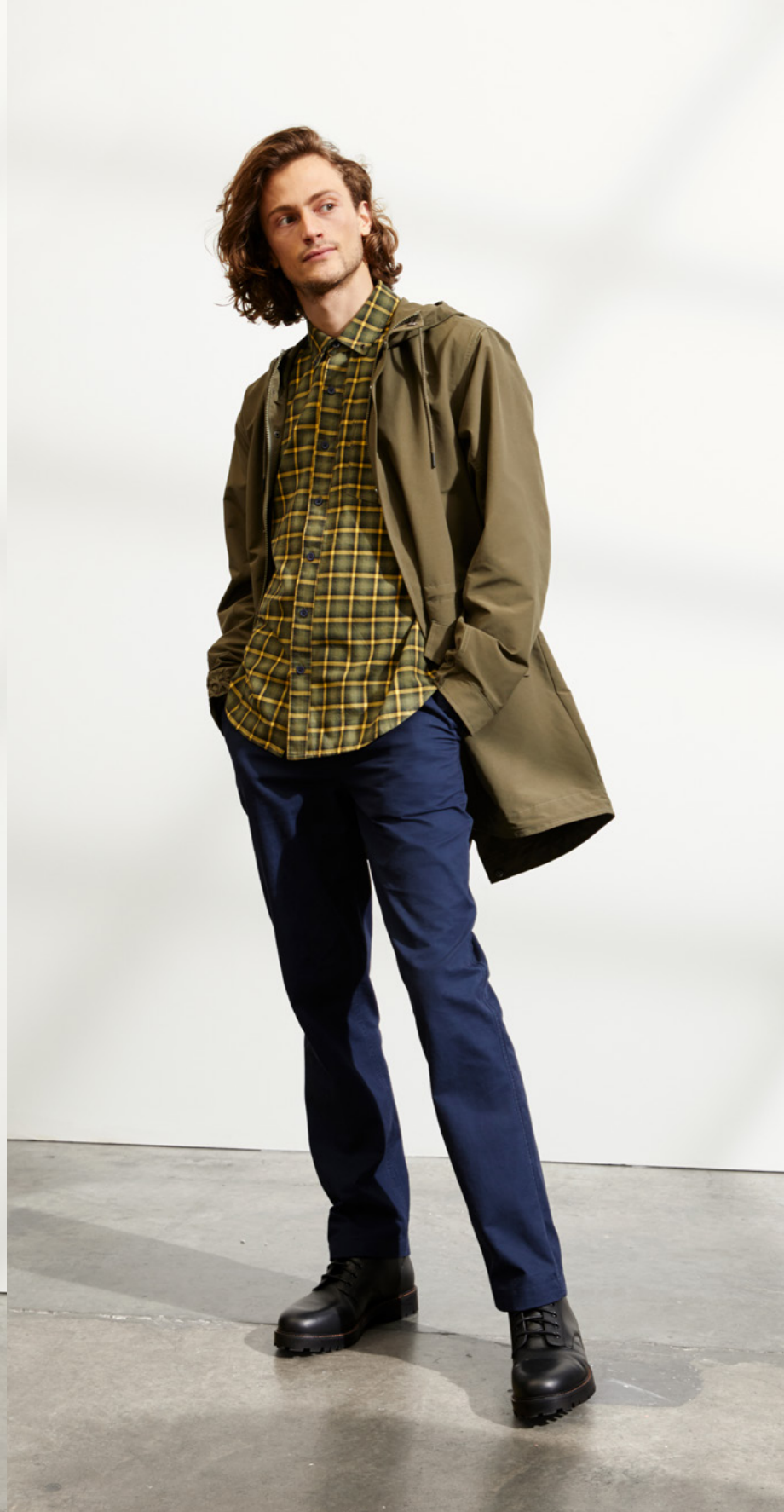
UNLINED FISHTAIL PARKA JACKET $30 EVERYDAY FLANNEL SHIRT $23 CHINO PANTS $25