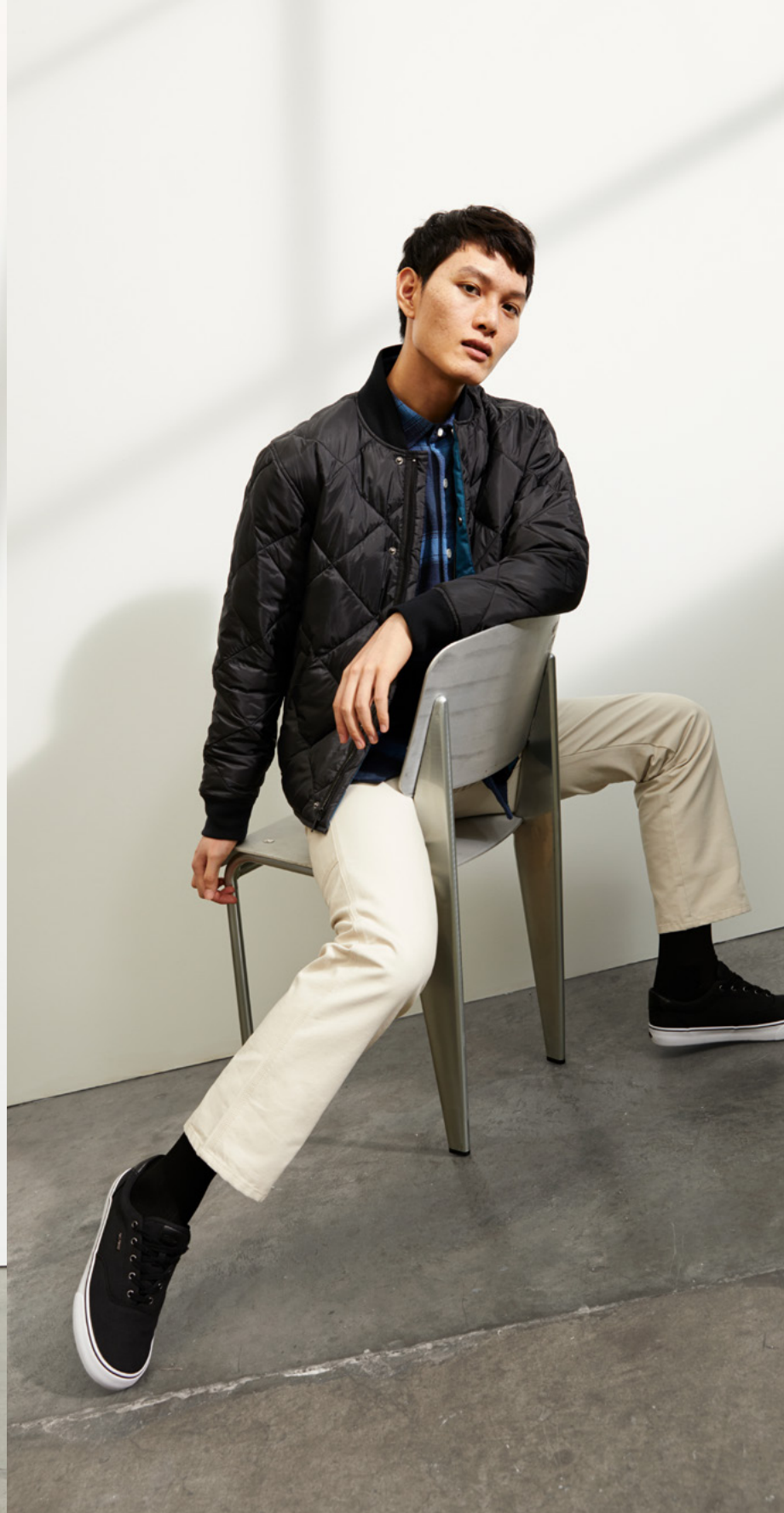
BOMBER JACKET $45 VINTAGE TWO-POCKET FLANNEL SHIRT $30 CARPENTER PANTS $30