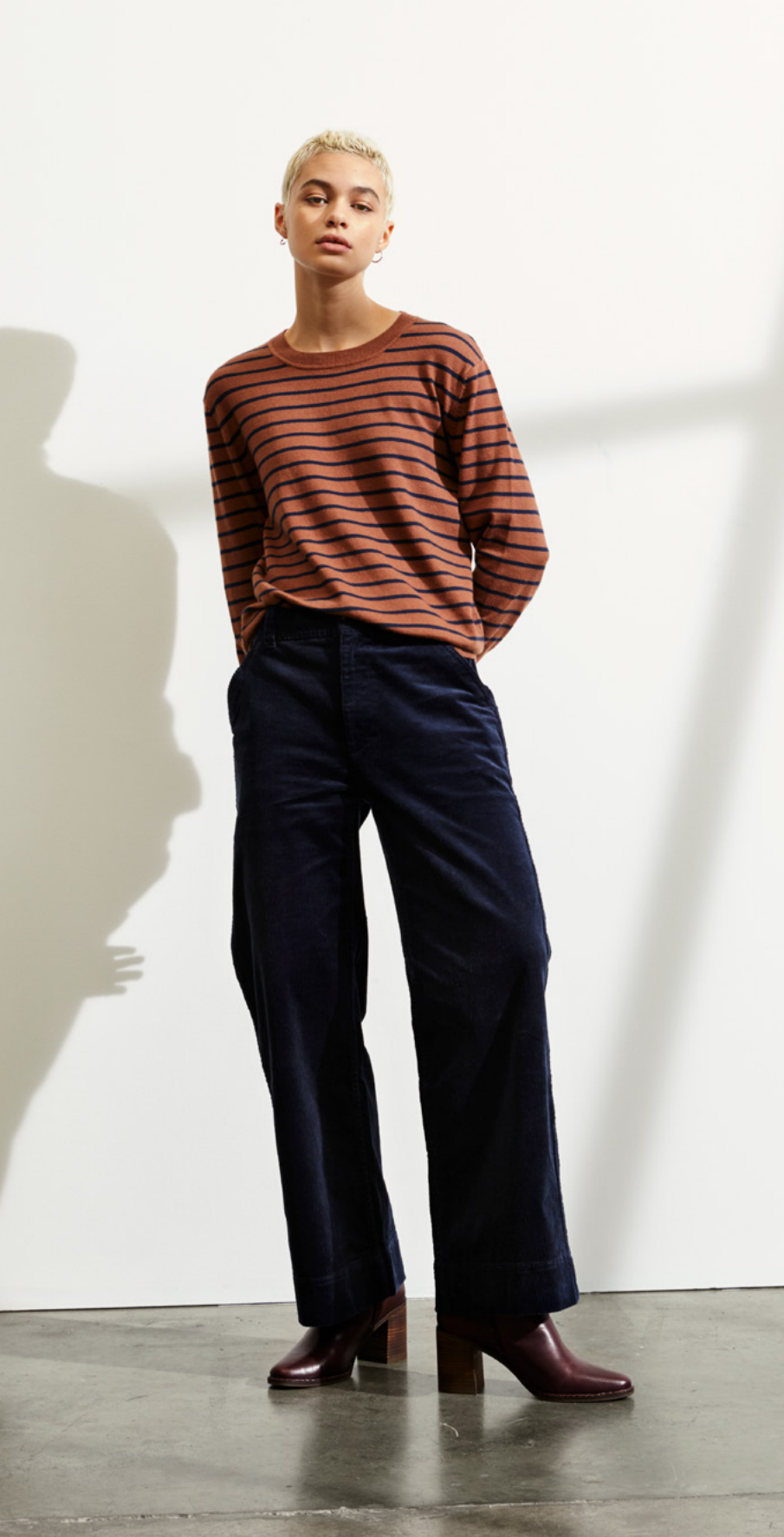
BOXY CREWNECK SWEATER $22 CORDUROY WIDE-LEG UTILITY PANTS $30