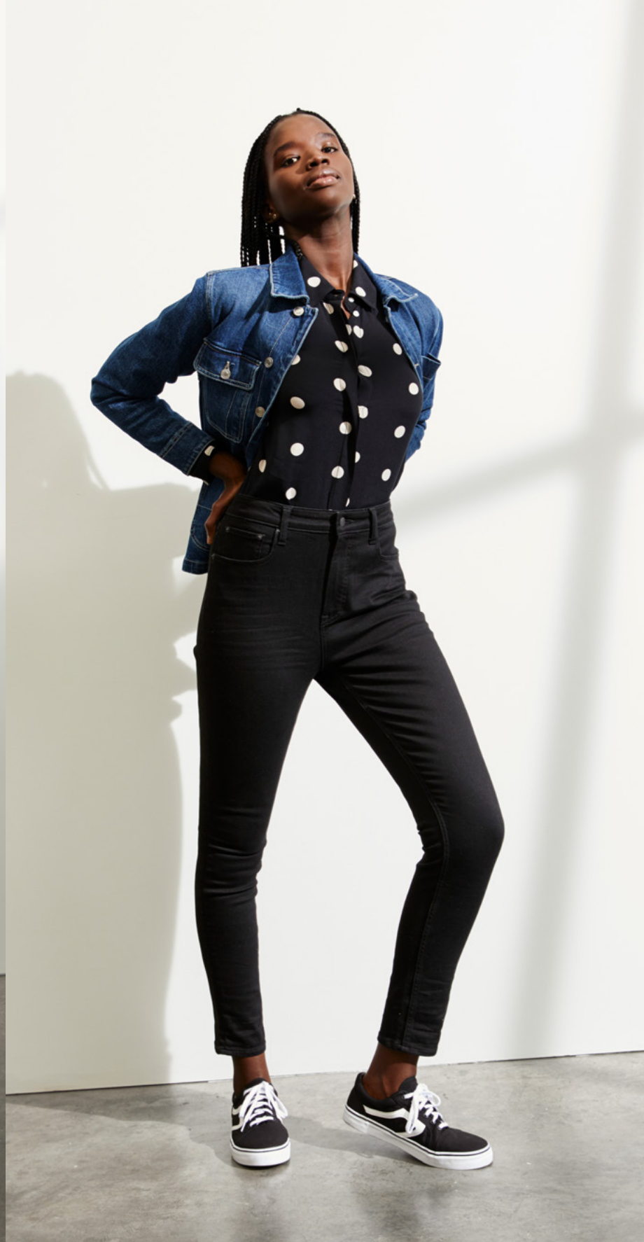
OVERSIZED DENIM BARN JACKET $36 VISCOSE PUT TOGETHER SHIRT $24 ESSENTIAL HIGH-RISE SKINNY JEANS $27