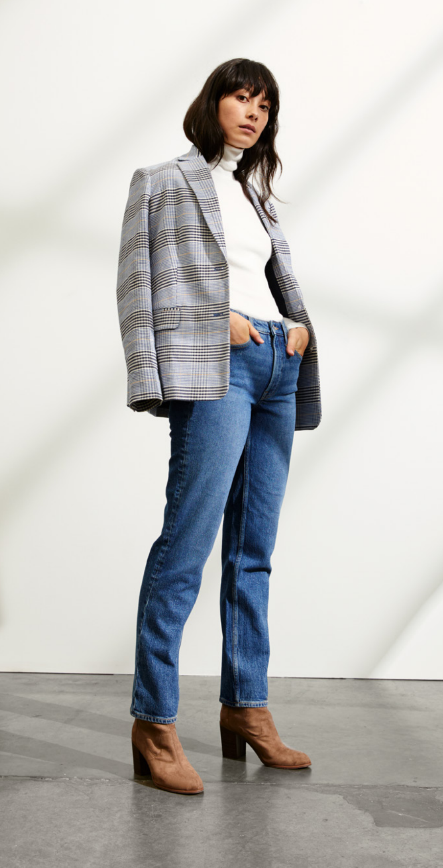
BOYFRIEND BLAZER $45 RIBBED TURTLENECK $14 ORIGINAL 90'S STRAIGHT LEG JEANS $27