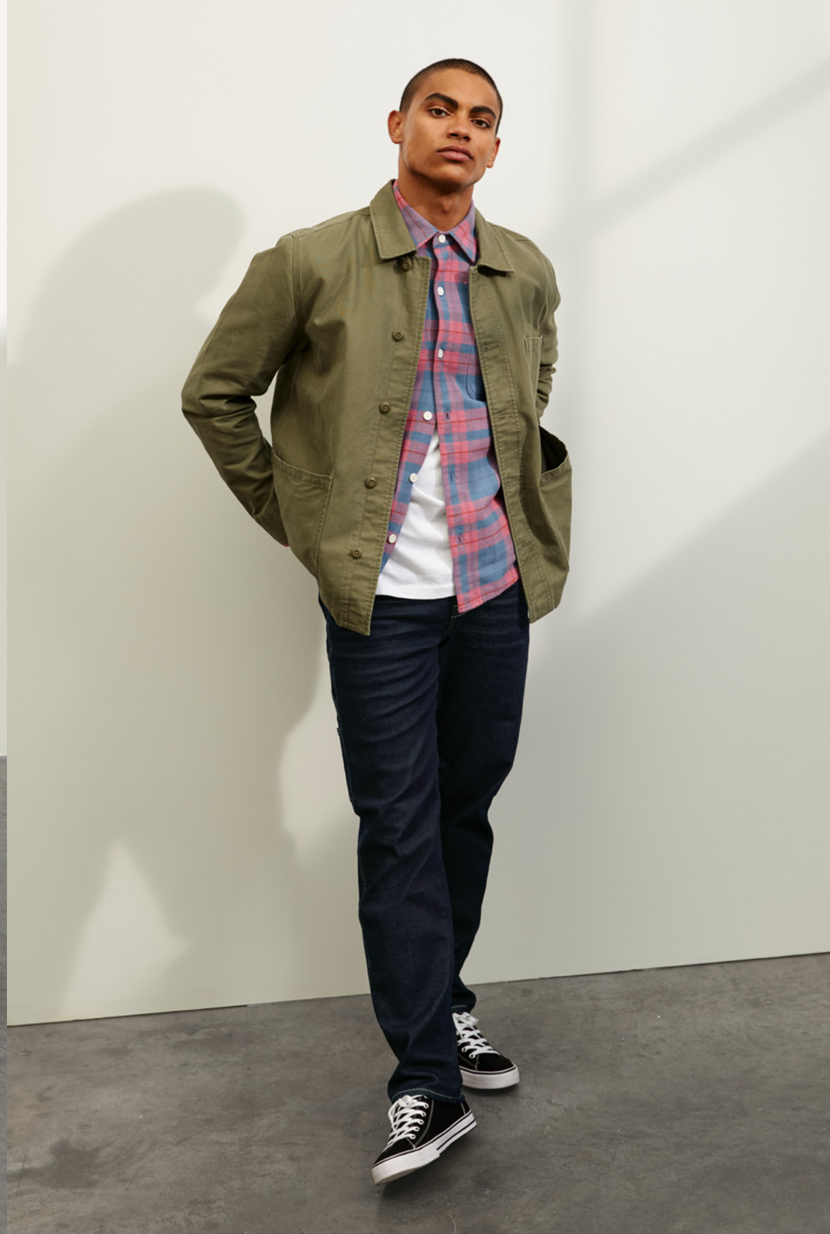
CHORE JACKET $30 VINTAGE TWO-POCKET FLANNEL SHIRT $30 EVERYDAY SHORT SLEEVE T-SHIRT $9 ATHLETIC FIT SLIM JEANS $27