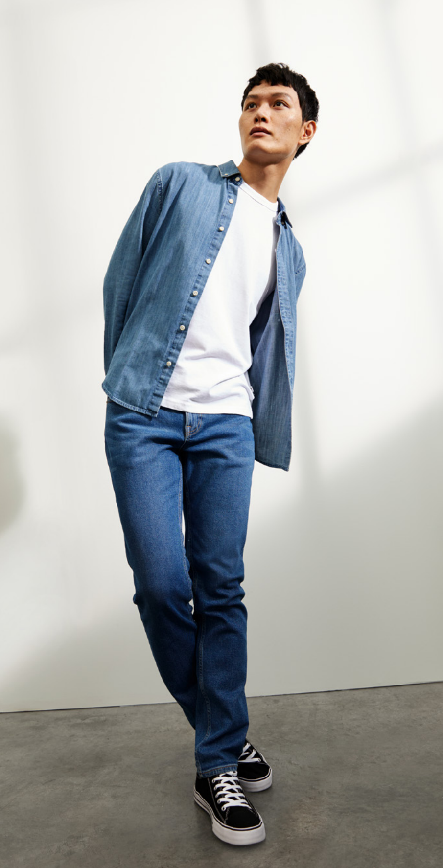
EVERYDAY DENIM SHIRT $23 EVERYDAY SHORT SLEEVE T-SHIRT $9 SLIM JEANS $27