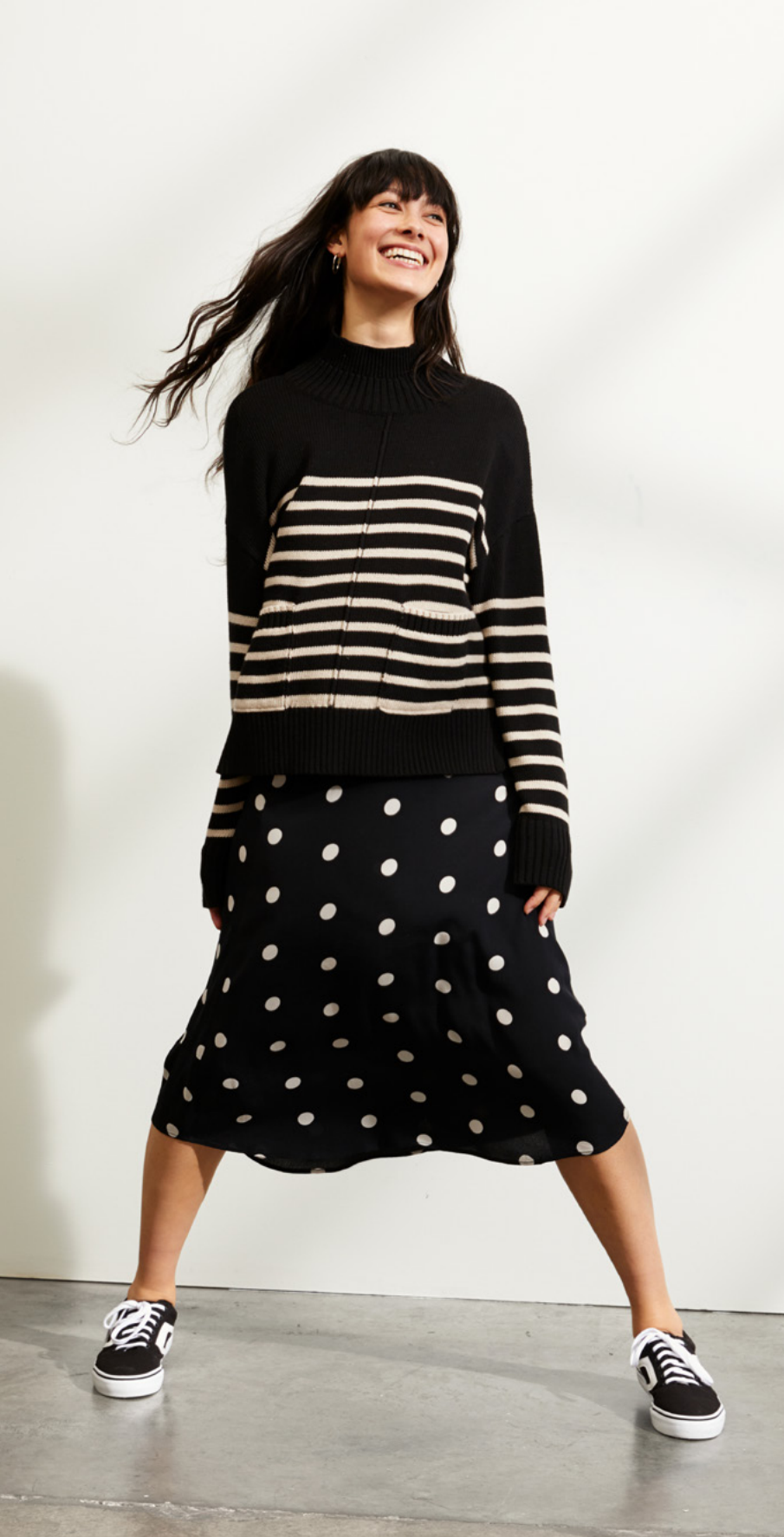
BOXY MOCKNECK SWEATER $25 VISCOSE SLIP SKIRT $22