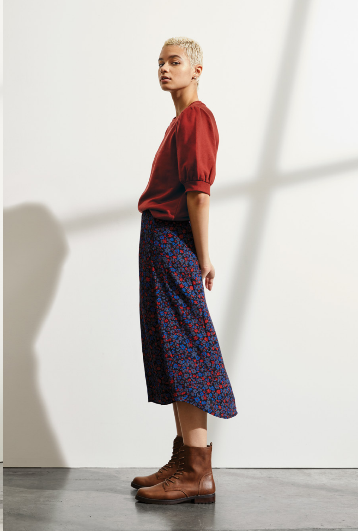
PUFF SLEEVE TOP $22 VISCOSE SLIP SKIRT $22