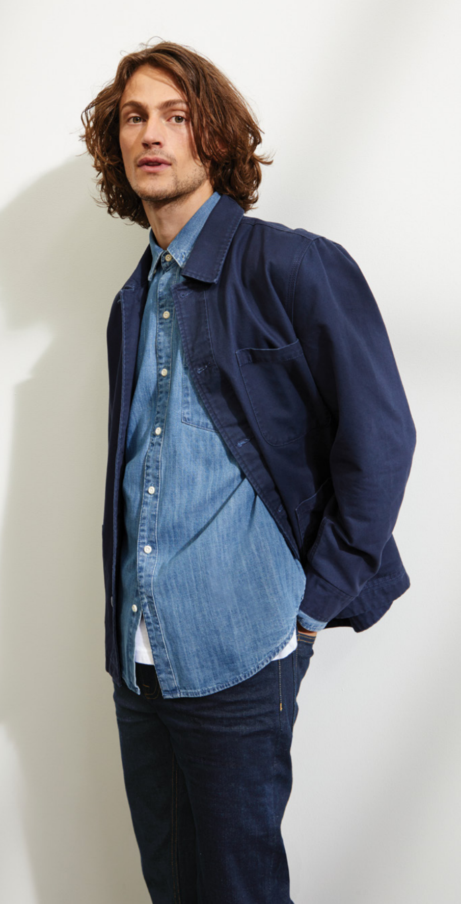
EVERYDAY DENIM SHIRT $23 CHORE JACKET $30 SELVEDGE SLIM FIT JEANS $40