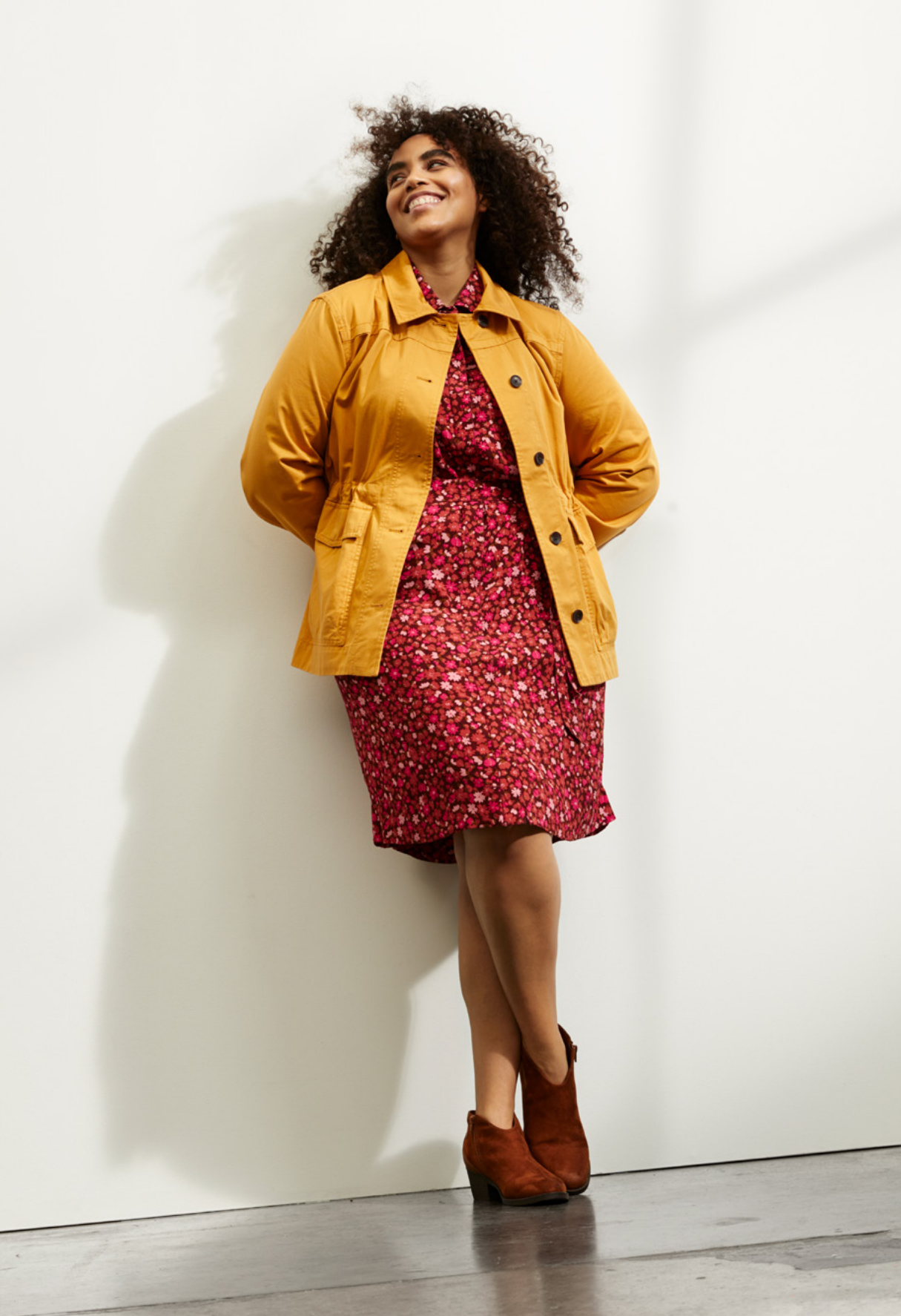
FATIGUE JACKET $29 BUTTON DOWN SHIRTDRESS $30