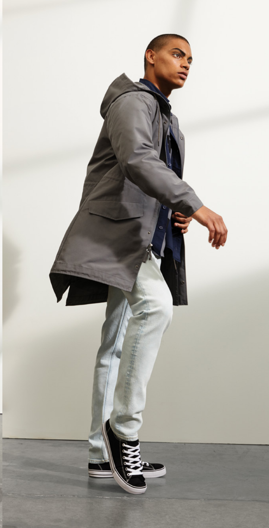
UNLINED FISHTAIL PARKA JACKET $30 UTILITY SHIRT $25 SLIM JEANS $27