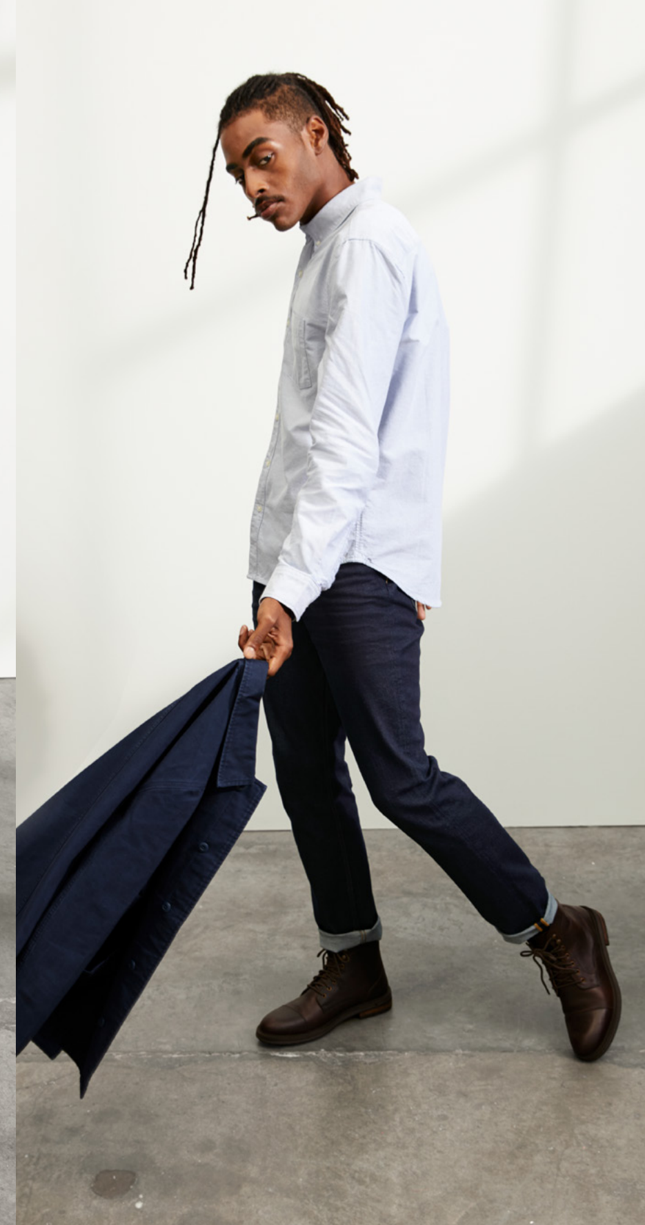
CHORE JACKET $30 EVERYDAY OXFORD SHIRT $23 SELVEDGE SLIM FIT JEANS $40