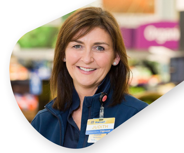
*** Walmart divested its retail operations in the United Kingdom and Japan in February and March of 2021, respectively.

The passion our associates have for service to customers and to one another inspires me. Whatever it is that inspires you, let's commit to building an inclusive environment built on opportunity for everyone. Let's celebrate what makes each of us unique and recognize that we have more in common than we might realize. By doing that we will help create a more inclusive world for all of us.